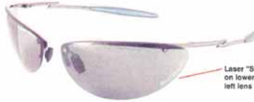
Laser "Sundog" on lower/side left lens