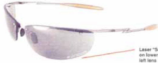
Laser "Sundog" on lower/side left lens